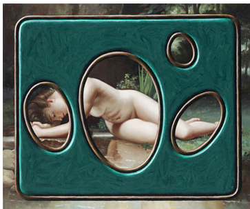
Peter Schuyff, green girl , 2007, Oil on found painting, 23 x 19.75 inches.