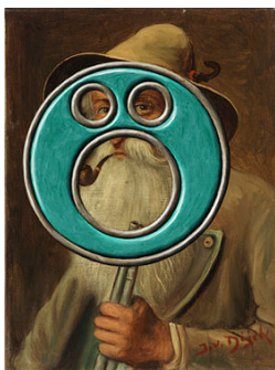
Peter Schuyff, lollipop , 2007, Oil on found painting, 16 x 12 inches

In this show of paintings and drawings done over older paintings and drawings by other artists, Schuyff continues his give-and-take with history. He places strange geometric patterns, surreal biomorphic shapes, and other cartoony configurations over older art. In this way, Schuyff delves into the past and the future, good and bad taste, effrontery and admiration all at the same time. Schuyff has a great touch, a good sense of humor, and a way with color that make these little things go a long way.